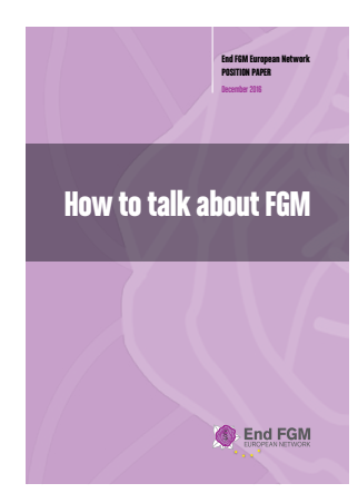
How to Talk About FGM