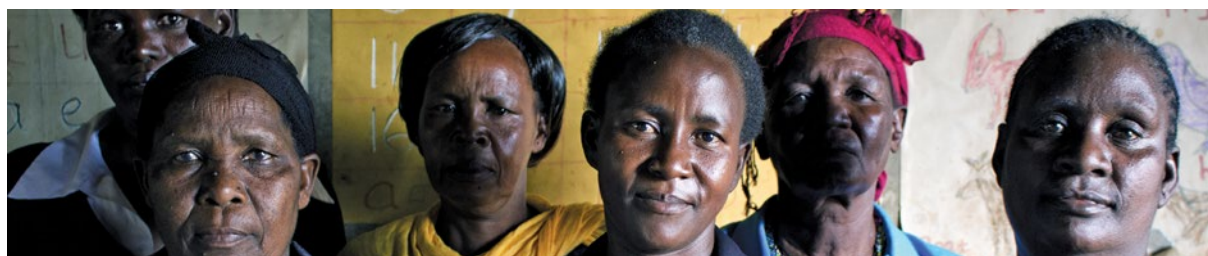
Teachers / – December 2016

or his life. We use this term to emphasise the woman or girl's resilience and as an empowering element of language , but without prejudice to the fact that the woman or girl may prefer to use the term victim .